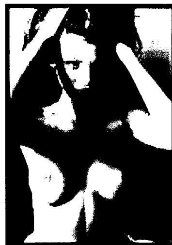
.._Images_eswa-a- funaro_i... 537 x 768 pixels - 157k photos1.blogger.com/ img/234/1096/1024/.._Imag...